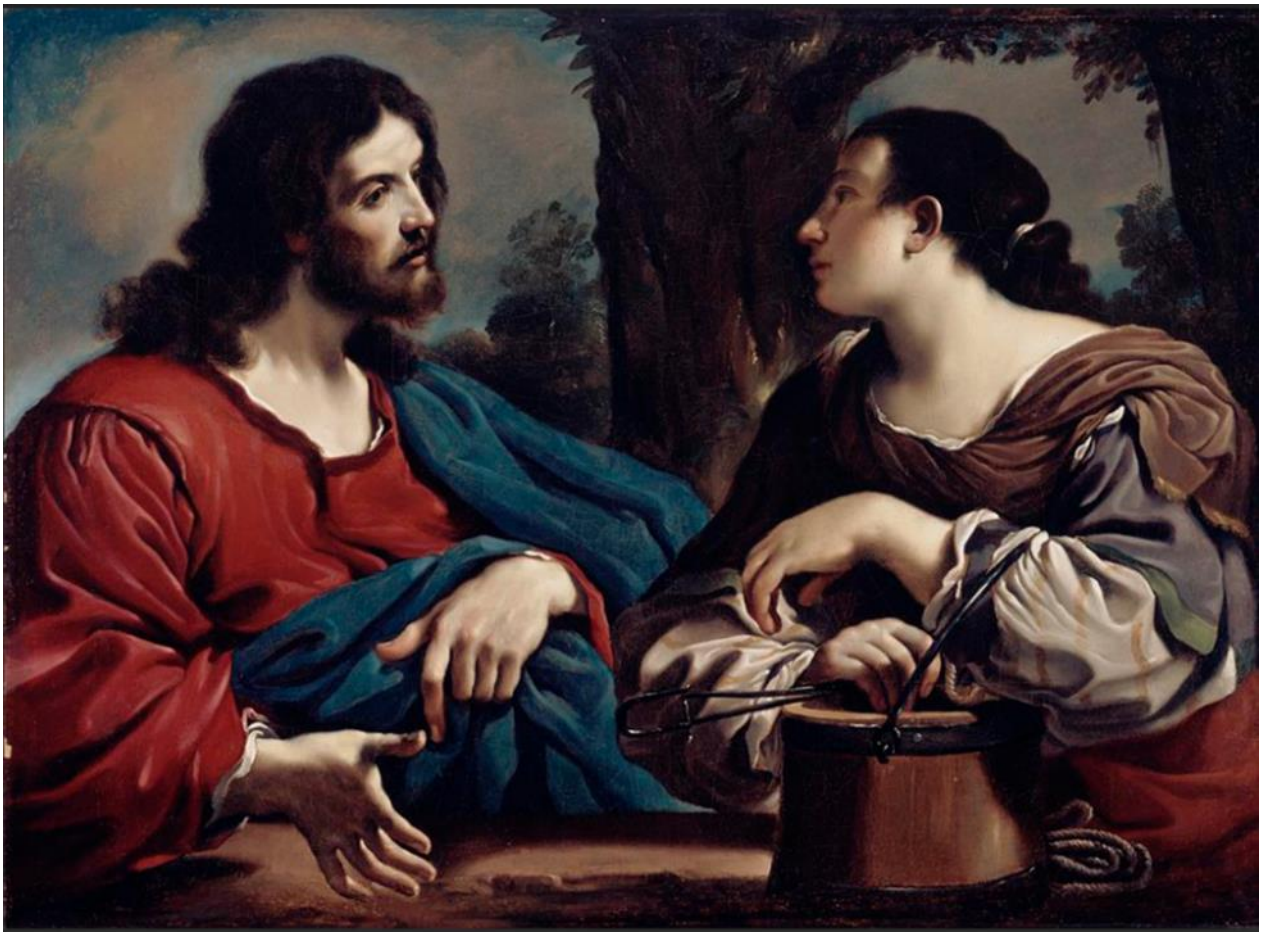
Christ and the Woman of Samaria by Giovanni Francesco Barbieri (Guercino) c. 1619–1620.

'The water that I will give,' says the Lord, 'will become in you a spring of water welling up to eternal life.' John 4.14