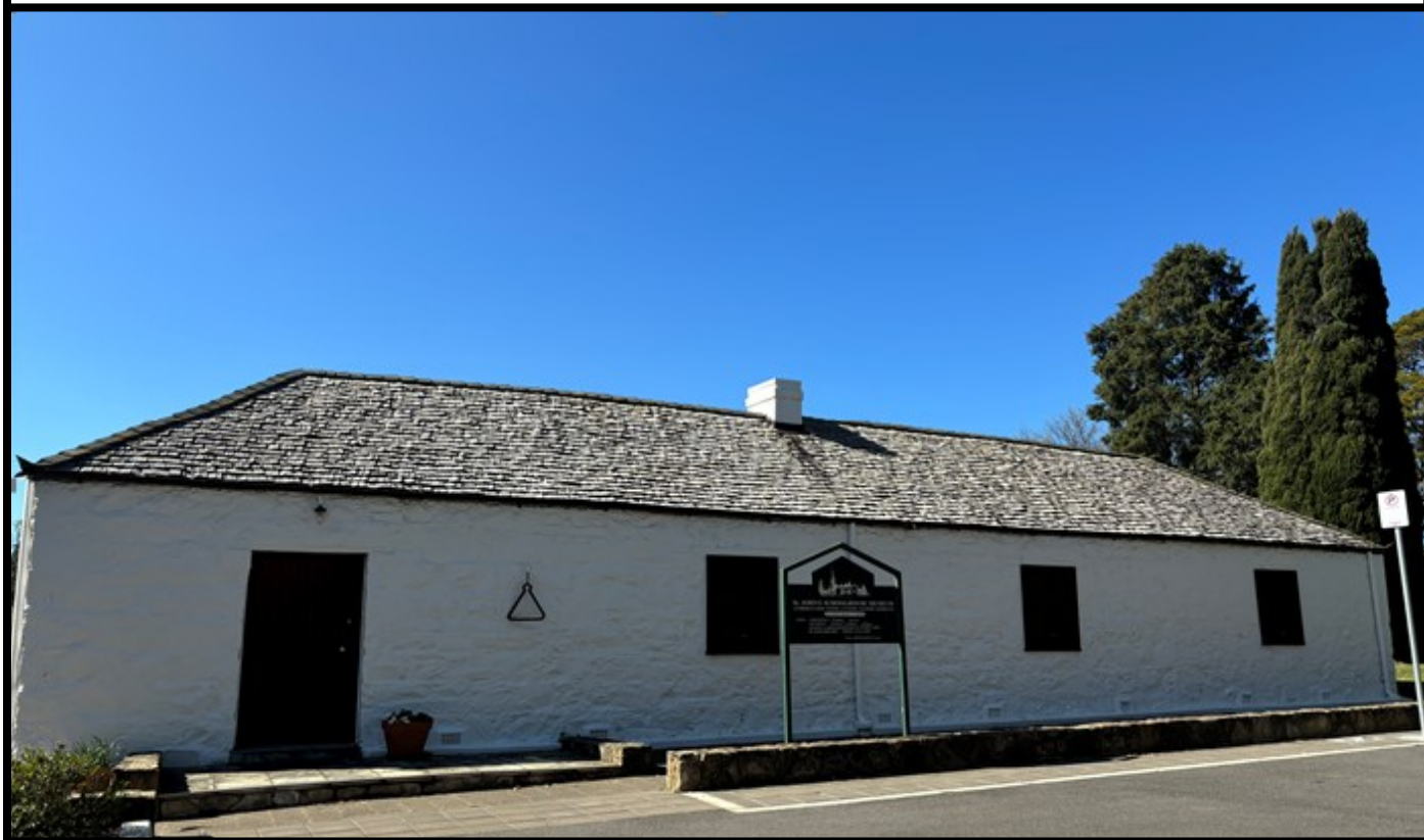
The Schoolhouse Museum