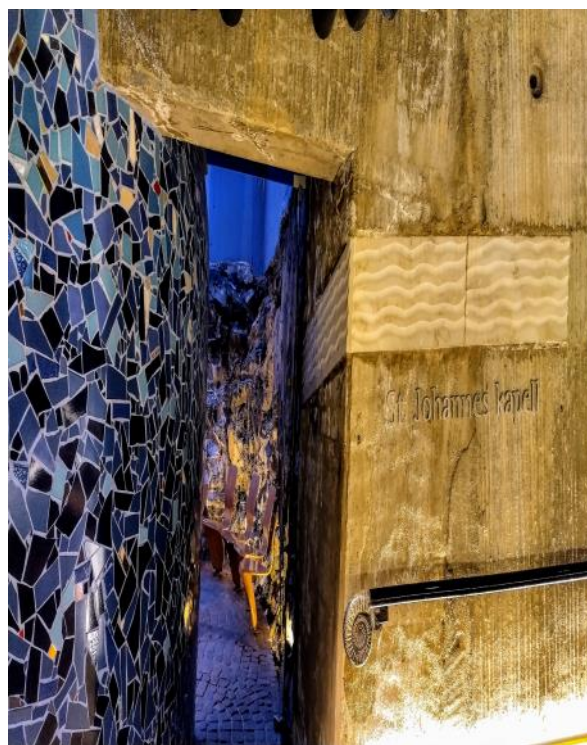
St John the Baptist Church, Norway, consecrated Midsummer's Day, 1990.