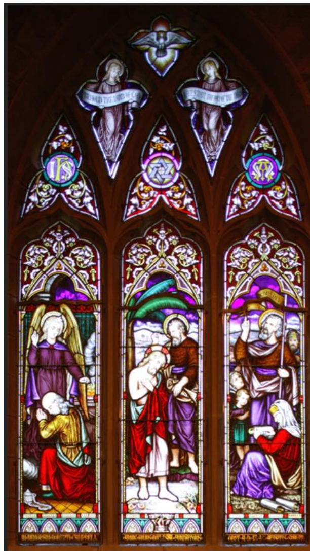
St John's East Window

You will go before the Lord to prepare his ways, to give knowledge of salvation to his people by the forgiveness of their sins. Luke 1.76–77