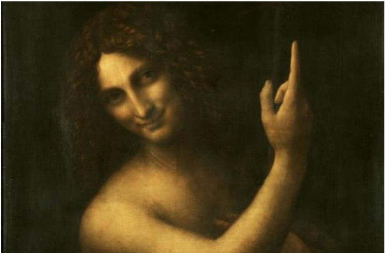
Saint John the Baptist, painting by Leonardo da Vinci, 1516, The Louvre, Paris

The time is fulfilled, and the kingdom of God has come near; repent, and believe in the good news. Mark 1.15