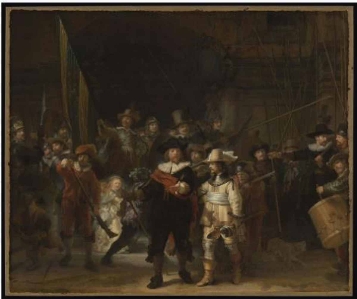
The Night Watch, Rembrandt van Rijn, 1642, Rijksmuseum, Amsterdam, The Netherlands

Watch and be ready, for you do not know on what day your Lord is coming. Matthew 24.42