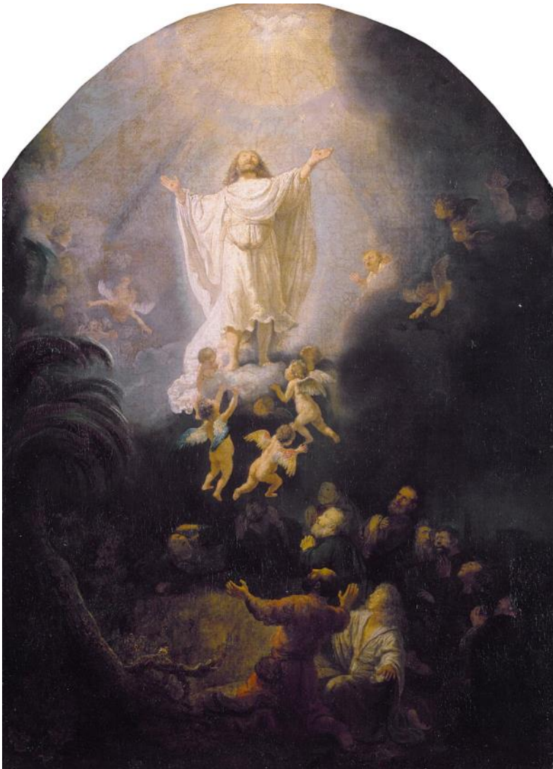
The Ascension by Rembrandt, 1636. (Bavarian State Painting Collections, Munich, Germany.)

This is eternal life, that we may know you, the only true God, and Jesus Christ whom you have sent. John 17.3