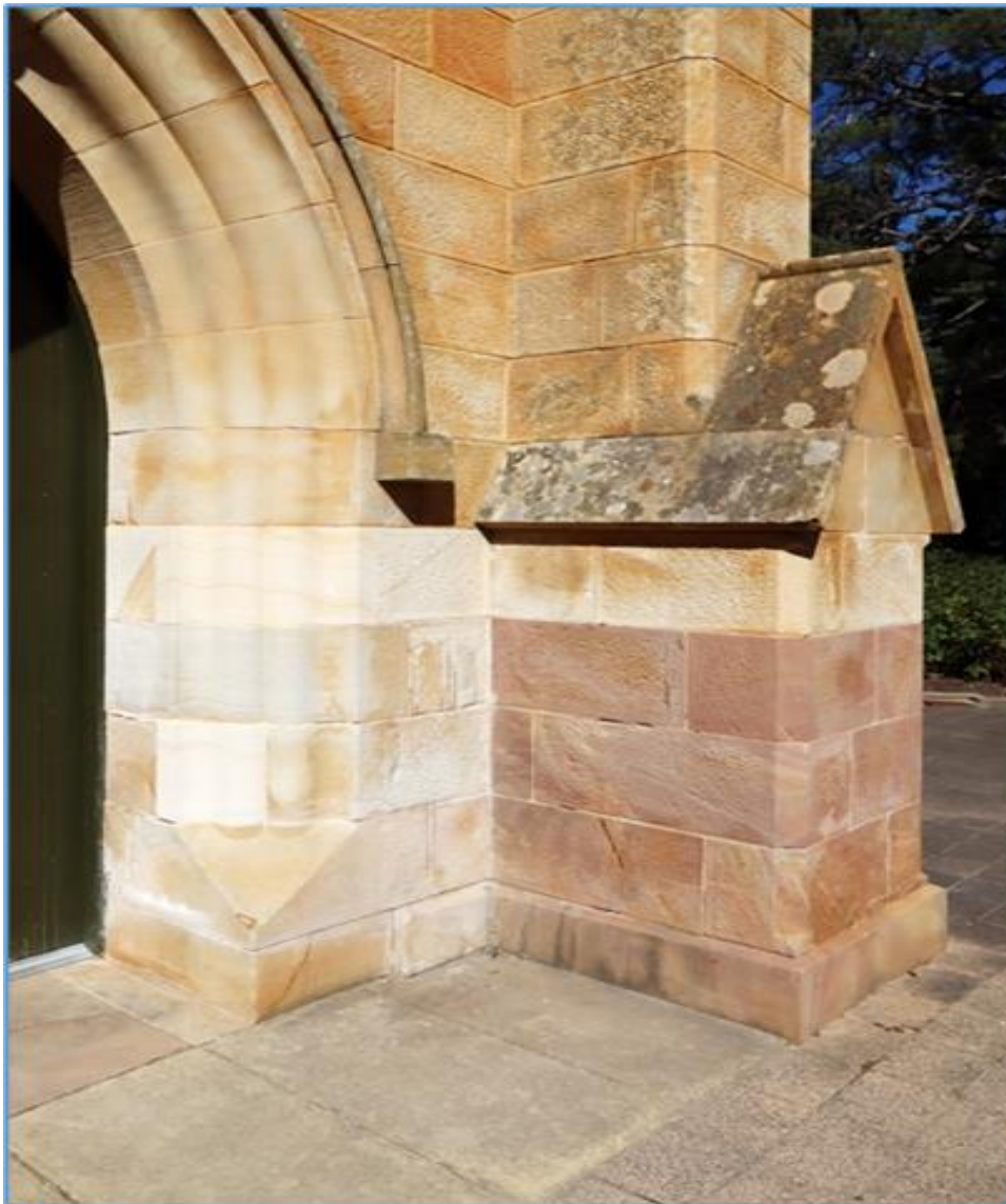
The finished job at the entry arch: after use of a poultrice, new slip stones were inserted accompanied by the use of softer, lime mortar.