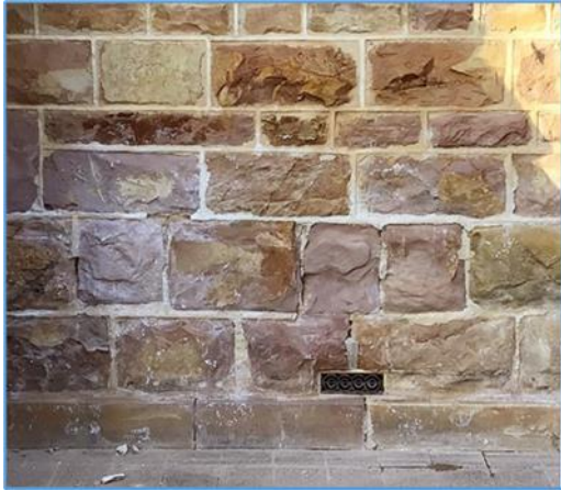
Eroded sandstone on the north face of the chancel, showing damage caused by the past use of non-porous cement mortar.