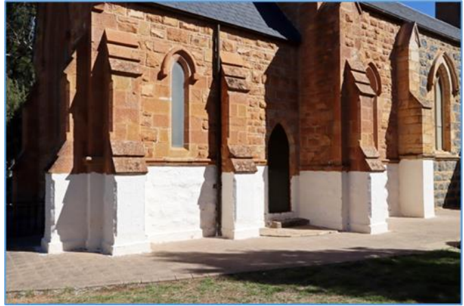
The poultrice applied to sandstone on the northern side of the church.