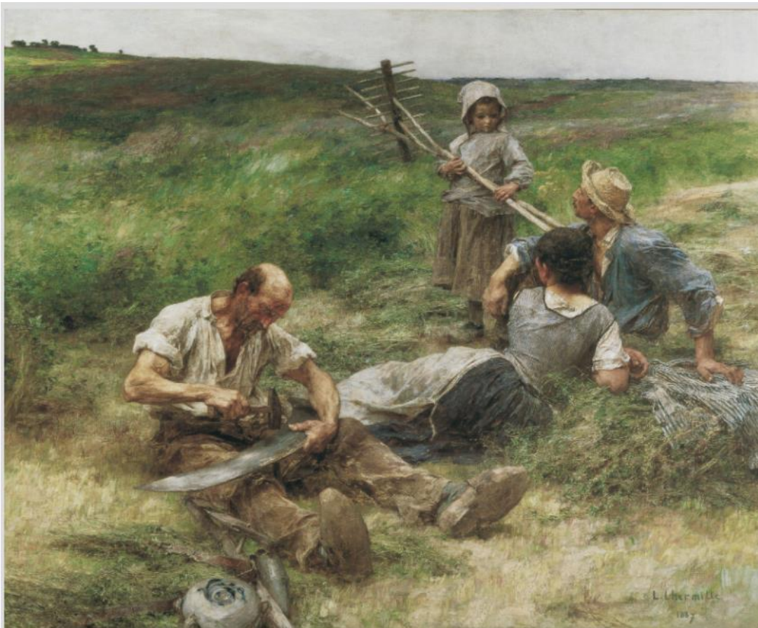
"Haymaking" by Léon-Augustin Lhermitte (1844 - 1925), 1887 , Van Gogh Museum, Amsterdam

We have peace with God through our Lord Jesus Christ, through whom we have obtained access to this grace in which we stand. Romans 5.1–2