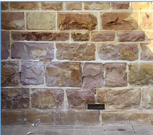
Eroded sandstone on the north face of the chancel, showing damage caused by the past use of non-porous cement mortar.