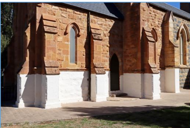
The poultice applied to sandstone on the northern side of the church.